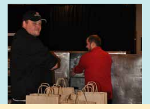
Kickapoo Creek Winery employees worked hard to prepare all the meals and get them organized for delivery.