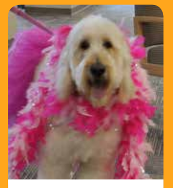
May your days be Merry and Bright! *Woof*