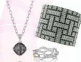
Jewelry Trio Value $1,805

Generously donated by Broms Furs and Fashions